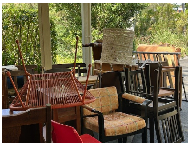
The Lifeline Pile: we've skipped the piles for the skip