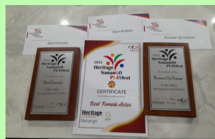
The Nanango awards