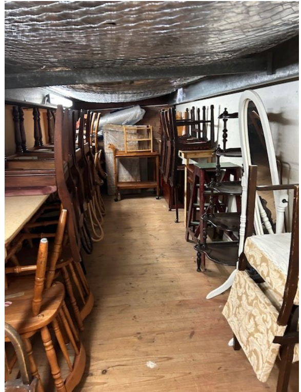
The joy of actually having a a-lofty corridor ...