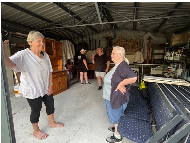
And we won't have to shed tears over the lack of space ...