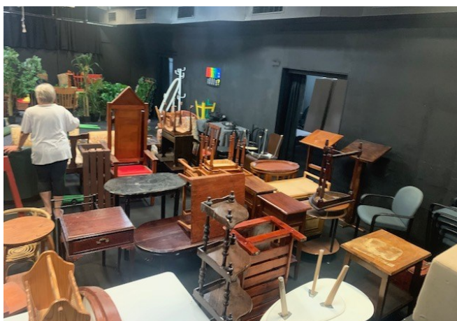
And here's some we prepared earlier ...